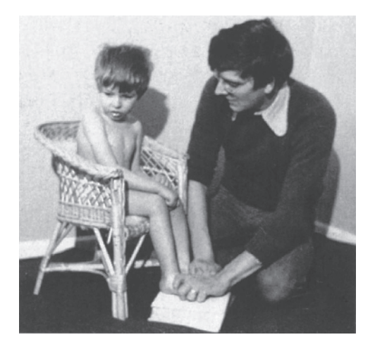
Figure 1.3. Same child being taught to sit by his father. Head preference to right, shoulders protracted, elbows flexed–pronated, hands flexed, knees and feet held symmetrical with hips. A symmetrical trunk.