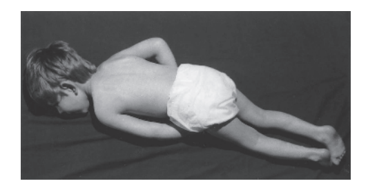
Figure 1.2. Same child with bilateral spastic quadriplegia with postural changes in prone. Asymmetry of arms caught under body. Hips and knees flexed, feet in equinovarus. Head preference is now to left.