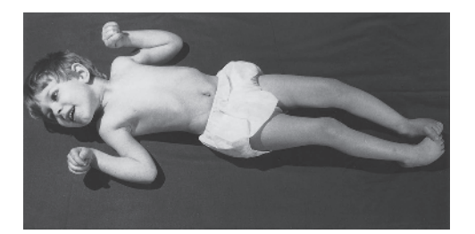
Figure 1.1. Child with bilateral spastic quadriplegia. Head preference to right, shoulders protracted, semiabduction, elbows flexed–pronated, wrists and fingers flexed, thumb adducted. Hips and knees flexed, tendency to internal rotation– adduction with feet in equinovarus, toes flexed.

Postural alignments (body shape) (see Figs 1.1–1.3). These are often extensors in the leg and flexors in the arm. However, the therapist will find many variations on this, especially when the child reaches different stages of development. The atypical limb postures become held by stiffness with shorter 'spastic hypertonic' muscles whose lengthened antagonists are weak, in that they cannot overcome the tight pull of the